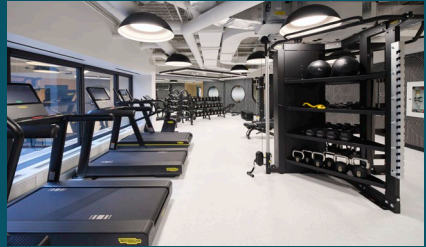
Boutique Fitness Studio